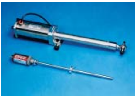
Series 951 LDT, 952 BlueOx™ LDT (not pictured) and 950 MD Mill-Duty Housings