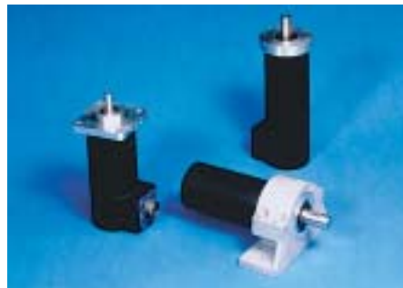
Series 1986 Standard Resolver Packages Gemco is a trademark of Ametek.

AMETEK ® AUTOMATION & PROCESS TECHNOLOGIES